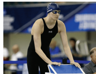
LEFT'S WAR ON WOMEN: Lia Thomas Nominated by University of Pennsylvania for NCAA 'Woman of the Year' Award

The radical left has used public schools to change our culture by indoctrinating naïve students into believing they can be whatever gender they choose . Chris Rufo exposes how teachers are taught to teach that male and female are simply “social constructs” that oppress nonconforming students . Chris Rufo, a fellow at the Manhattan Institute , has documents showing that teacher training workshops teach teachers in San Diego’s public schools (K-12) to teach that heterosexuality is a system of oppression and eliminate the words man and woman to encourage kids to adopt synthetic gender identities like gender queer, two spirit, pan-sexual , etc. Chris said, “This is a pattern we’re seeing all across the country but schools hide what they’re doing so they can tell uninformed parents – NOT IN OUR SCHOOL.”